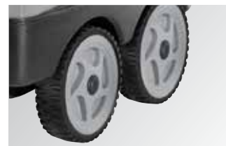
4 twinned solid wheels to facilitate movement on any type of surface