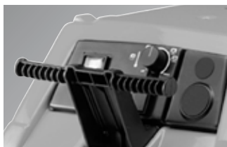
Simple and intuitive control panel, with switch and temperature regulation thermostat