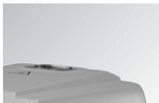
High-efficiency diesel vertical boiler with steel coil (stainless steel on request)