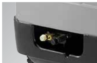
Easily connected to all Lavor cold water high pressure cleaners for hot water generation